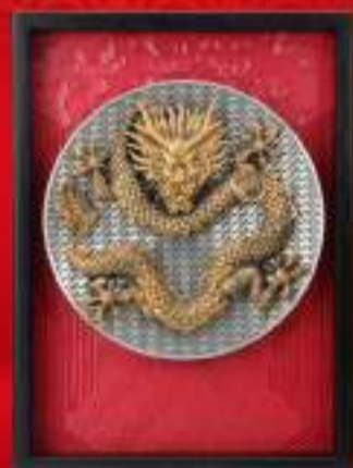
Limited Edition 2024 Year of the Dragon Plaque