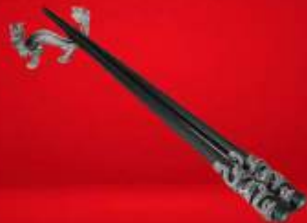
2024 Year of the Dragon Chopsticks & Rest Set