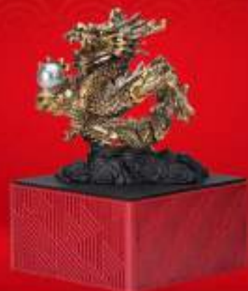
2024 Year of the Dragon Figurine